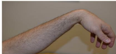
Inability to lift wrist or fingers (extensor weakness AKA Wrist Drop)

An occupational therapist can provide these splints as well as exercises while the nerve is healing.